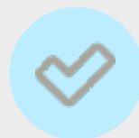
HR Control & Compliance