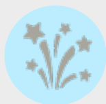
Global Diversity & Talent Management Staffing Recruitment