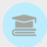
Learning & Development