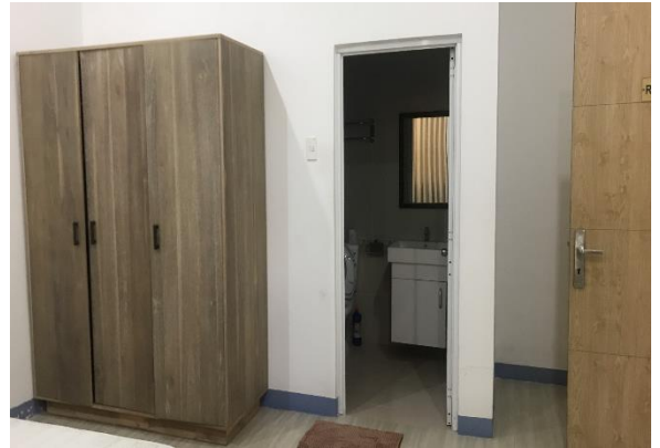
Living room area