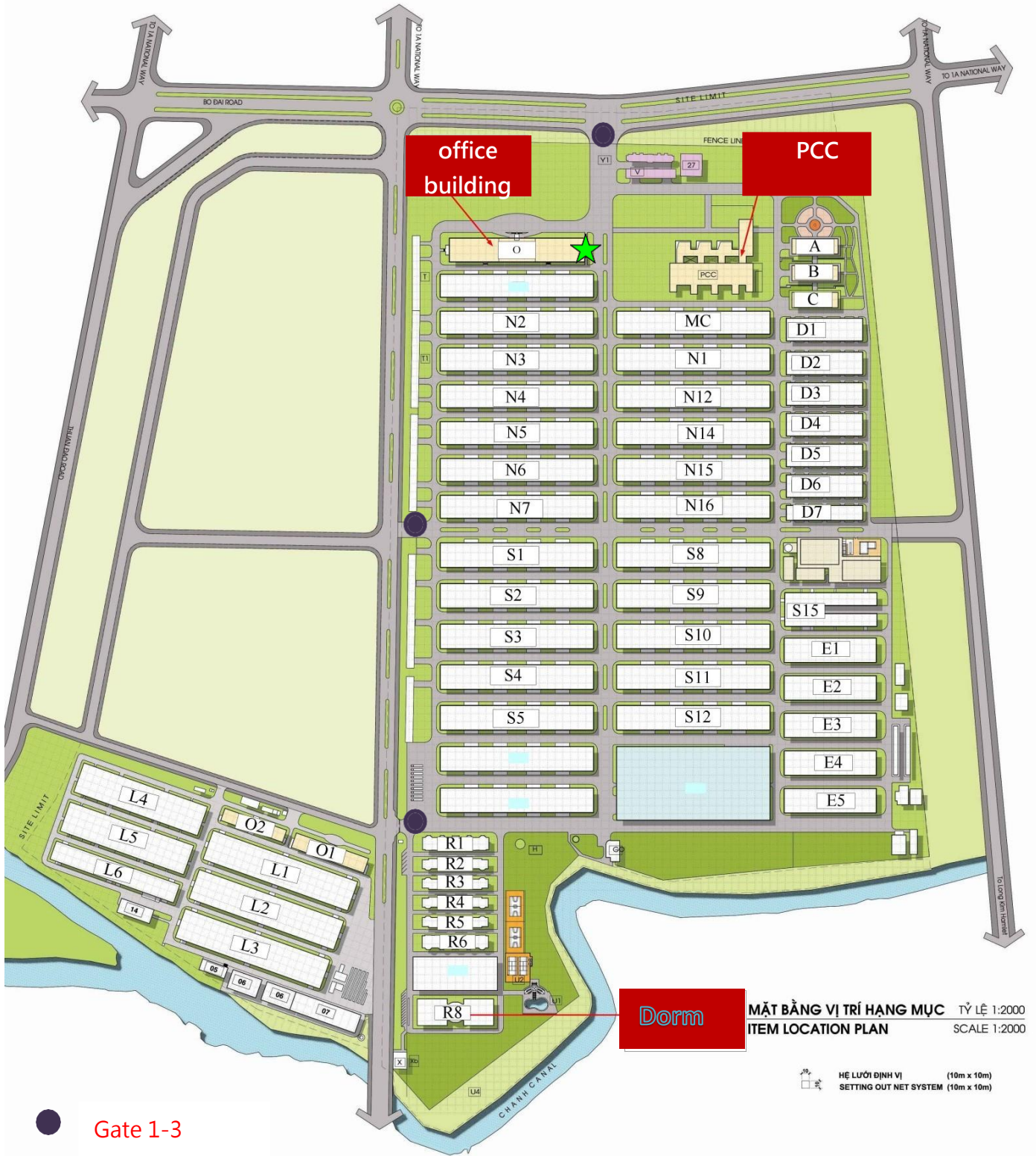
MẶT BẰNG VỊ TRÍ HANG MỤC TỶ LỆ 1:2000 ITEM LOCATION PLAN SCALE 1:2000

HỆ LƯỚI ĐỊNH VỊ (10m x 10m) SETTING OUT NET SYSTEM (10m x 10m)