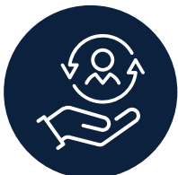
Equity & Inclusion