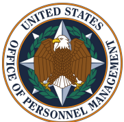
Office of Personnel Management