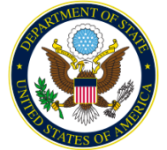
US Department of State