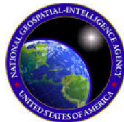
National Geospatial Intelligence Agency